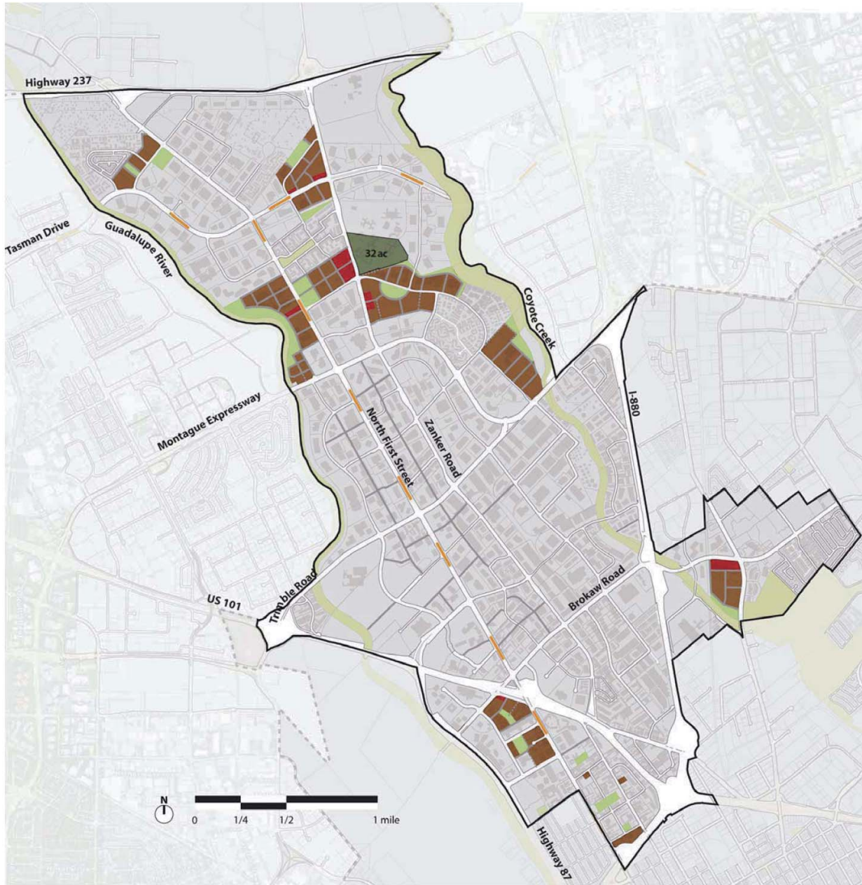
Figure 3 Planned Neighborhood Parks