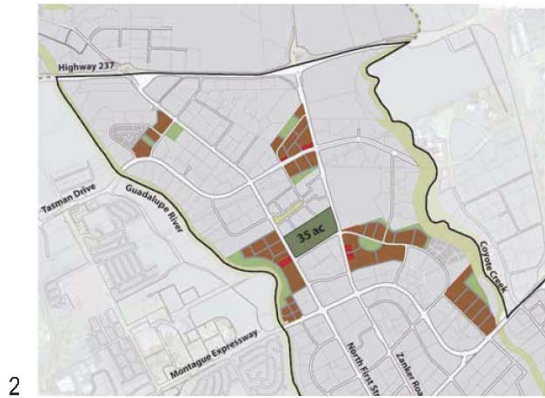
Figure 4 Potential Community Parks